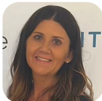
Krystal Thoe Legacy Healthcare