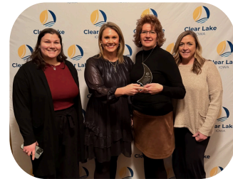
North Iowa Community Action Organization, Spirit of North Iowa