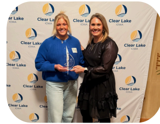
Starboard Market, Business of the Year