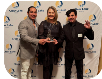
Gyro Place, Entrepreneurs of the Year